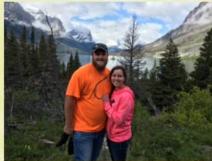
Glacier National Park