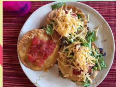
I love tacos!

I know the importance of cultural awareness and that each person has a purpose by bringing their own experiences to the table. Everyone is equal and valued!