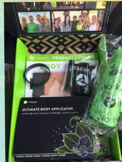
My home business