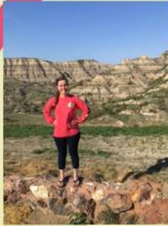
Yellowstone National Park