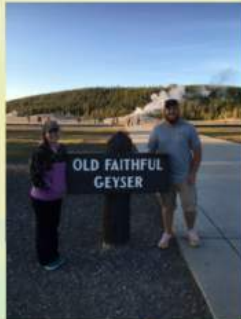
Theodore Roosevelt National Park