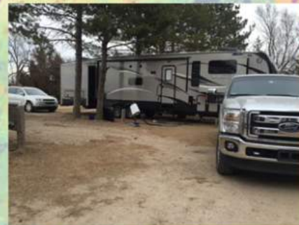
Our home on wheels